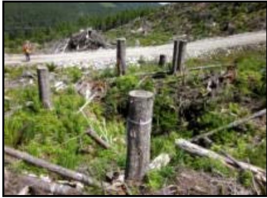
Sinkhole protected with high stumps.

BMPs for non-GAR karst features depend on the assessed vulnerability of the karst terrain and type of forestry activity (road building and related activities, timber harvesting and post harvest operations). The management handbook recognizes the need for flexibility on which strategies to employ for non-GAR karst features since a 'one-size-fits-all' approach is not realistic. Strategies should be tailored to the specific feature, and also consider operational constraints such as harvest system (conventional logging, uphill cable, downhill cable and helicopter) and stand structure attributes. For example, it is difficult to control logs when downhill yarding, which may make it difficult to