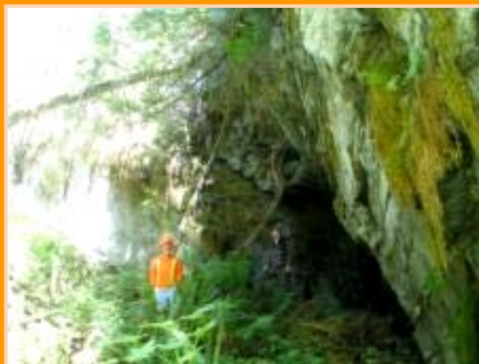
Entrance to a significant cave.

Maintain a two tree-length reserve and an adjacent management zone of an appropriate size to protect the reserve from windthrow.