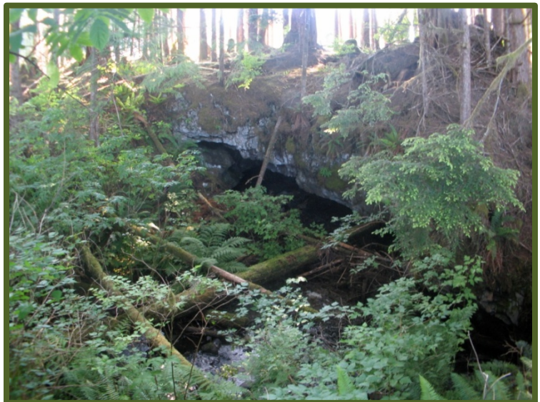
Entrance to a karst cave.

BC, especially in coastal areas, has some of the most significant karst terrain in North America. Karst is a distinctive topography in which the landscape is largely shaped by the dissolving action of water on soluble rock (usually limestone, dolomite or marble) over many tens of thousands of years. This geological process results in a unique landscape system composed of unusual surface features interconnected with underground drainage systems and caves.