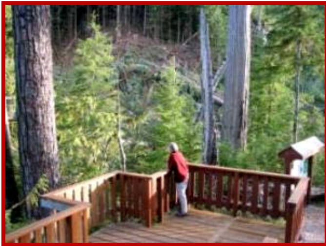
Platform overlooking Devil's Bath.

The Devil's Bath is a steep-walled sinkhole containing a one hectare lake with naturally occurring coarse woody debris. It is connected via multiple caves and conduits extending for nearly a kilometre to Benson River, and much of this network provides habitat for salmon. Devil's Bath is one of the largest features of this type in North America and it has a large viewing platform and interpretive sign kiosk overlooking the Devil's Bath.